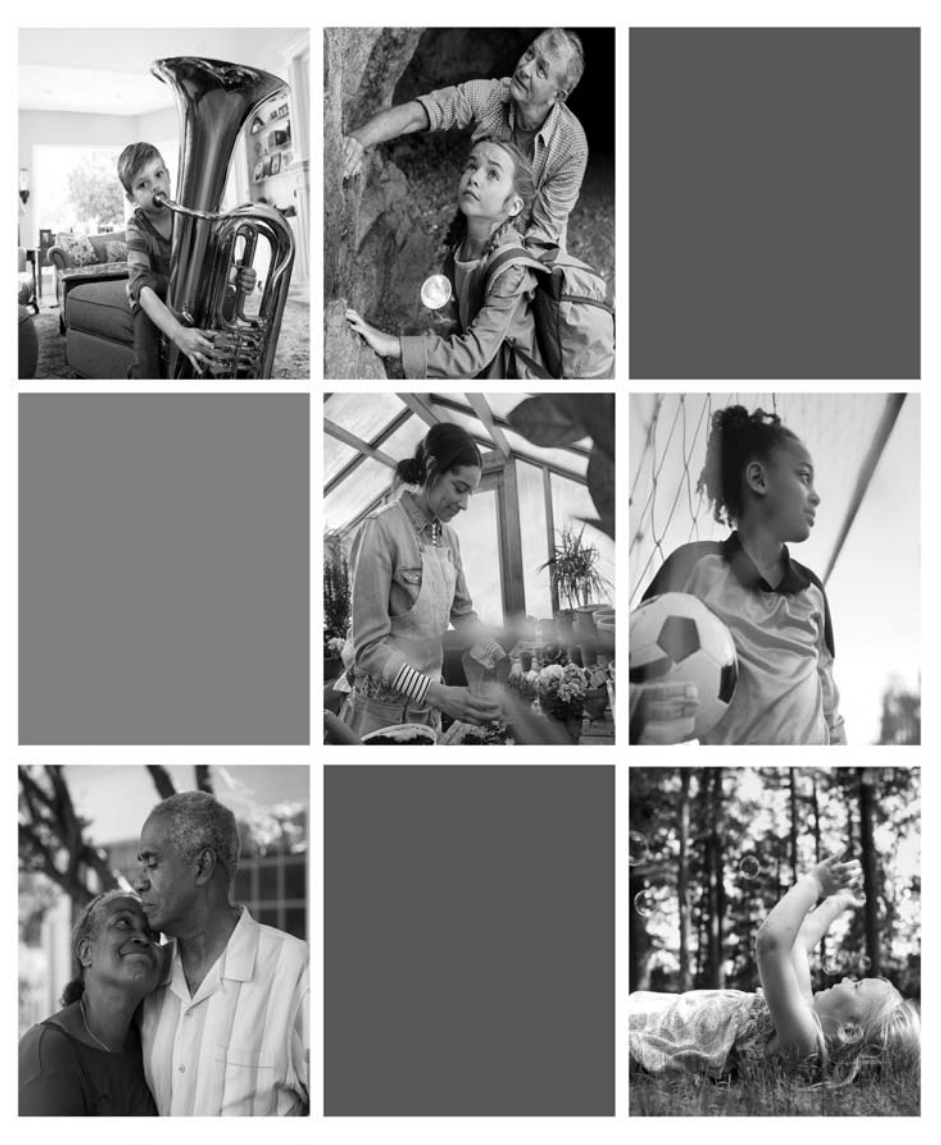
Your Health Care Benefits Program

Blue Cross and Blue Shield of Illinois, a Division of Health Care Service Corporation, a Mutual Legal Reserve Company, an Independent Licensee of the Blue Cross and Blue Shield Association