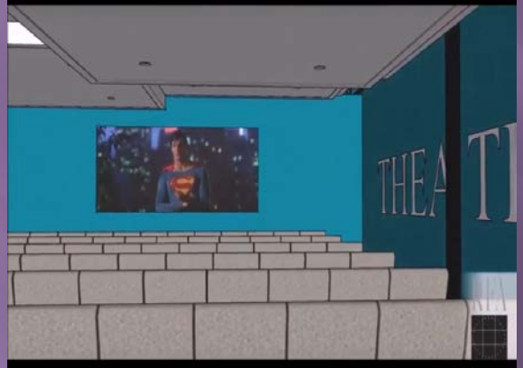
A theater for watching movies, presentations and performing

An activities coordinator dedicated to organizing more community outings