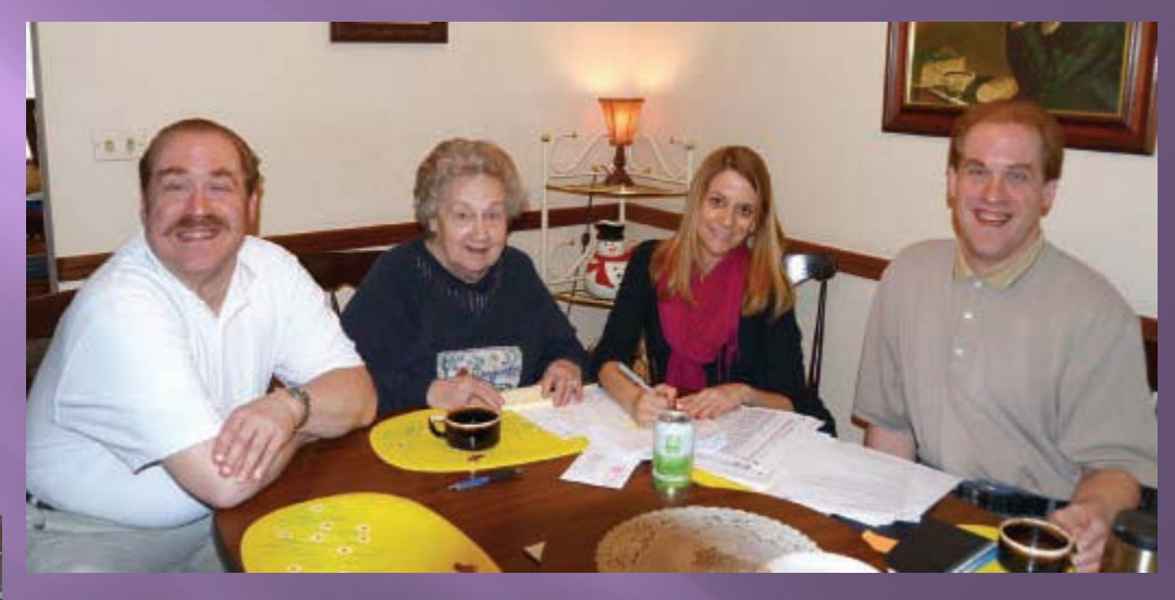
Self-Directed Assistance/Case Management

In 2019, $2,313 per month to purchase services